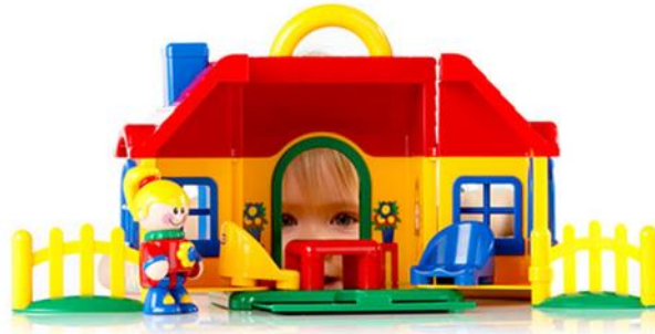
Families of Toddlers and Preschoolers

Want to get out of the house and meet other young families of Knox? Then join us for a time for parents and kids to play and socialize. Many toys will be put out for the kids during this open house play group.